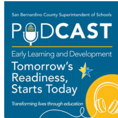
(SBCSS Podcast Episode)